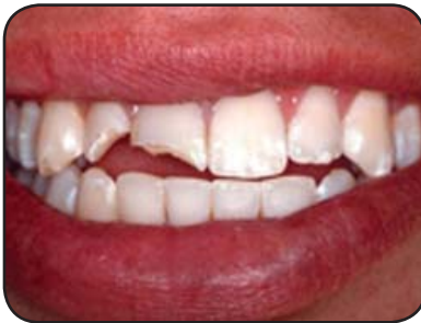
Restore a chipped tooth