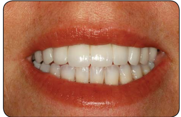
After all-porcelain crowns