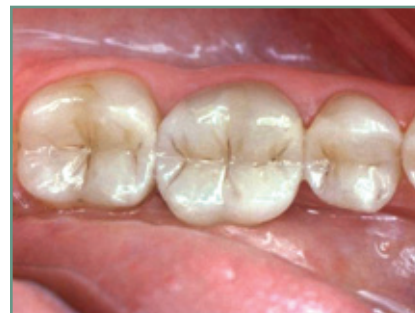
A natural look

Resin fillings are a great way to restore your back teeth. Because they bond directly to teeth, they provide the added strength that damaged teeth need to withstand frequent biting pressure. Also, we can match the color of the resin to your teeth to preserve your beautiful, natural-looking smile.