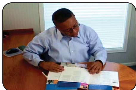
Thoroughly read insurance plans

Even though most plans pay only for basic services, we believe that you should be able to choose the most appropriate dental treatment for you and your family.