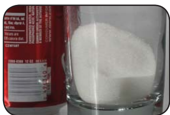
One soda = 10-12 tsp of sugar