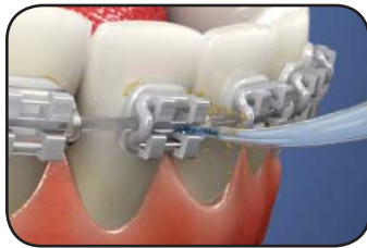
Easily cleans around braces

No matter why you choose an oral irrigator, you will get the best results when you correctly use it.