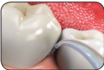
Rinsing below the gumline