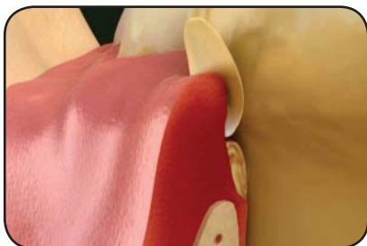
Popcorn hull trapped in the sulcus

There are several conditions that can cause a periodontal abscess. Many abscesses are caused when periodontal infection flares up in a gum pocket and quickly grows, forming a ball of pus. Injured gums can sometimes form an abscess when they are infected by bacteria that live naturally in your mouth, especially if the gums are already affected by periodontal disease.