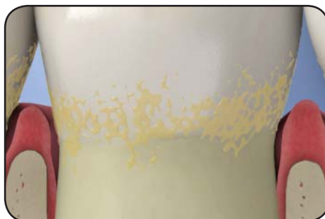
Plaque is difficult to see