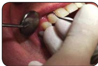
Removing plaque below the gumline