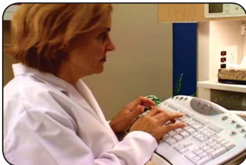
Sharing electronic information

HIPAA regulations apply to most health plans and to any healthcare provider who electronically transmits healthcare information.