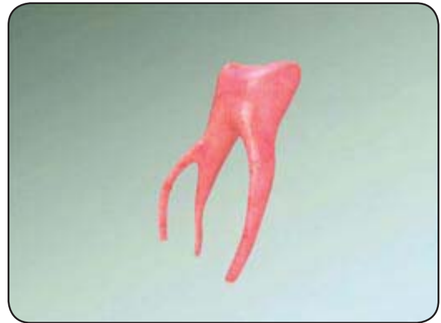
Narrow, curved and branched canals