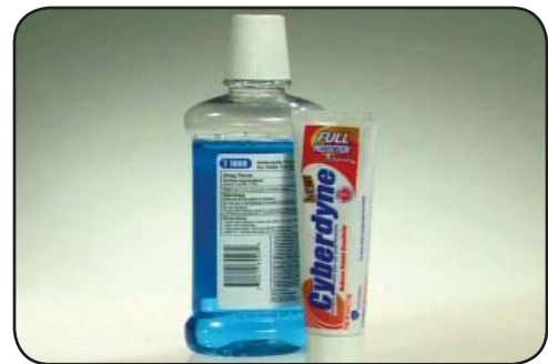
Desensitizing oral care products

The dentin can become exposed through various processes, such as abfraction, erosion, and abrasion. Abfraction occurs when one tooth hits sooner than the rest, causing the tooth to flex. Over time, this continual flexing causes the enamel to separate from the dentin.