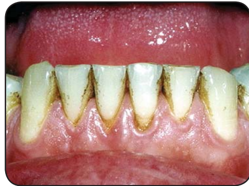
Smoking contributes to gum disease