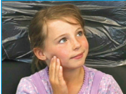
Your comfort is important