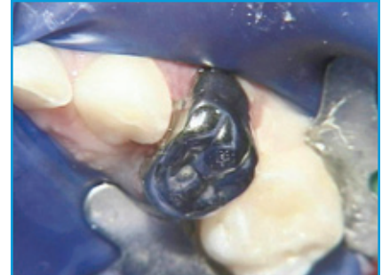
Cemented in place

Small cavities in primary teeth can be repaired with fillings because, after we remove the decayed part of the tooth, there's still plenty of remaining natural tooth structure. However, when a primary tooth has a large cavity, there may not be enough tooth structure left to place a filling. For this reason, we use crowns to repair large cavities in primary teeth. A crown covers a damaged tooth to strengthen and protect it.