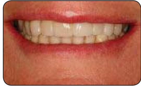
The result is a dazzling smile