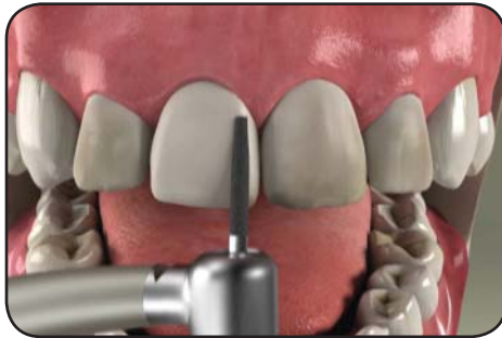
Preparing the teeth

Veneers can give you straighter, whiter, and more even-looking teeth. The porcelain has a translucent quality that resembles your natural teeth.